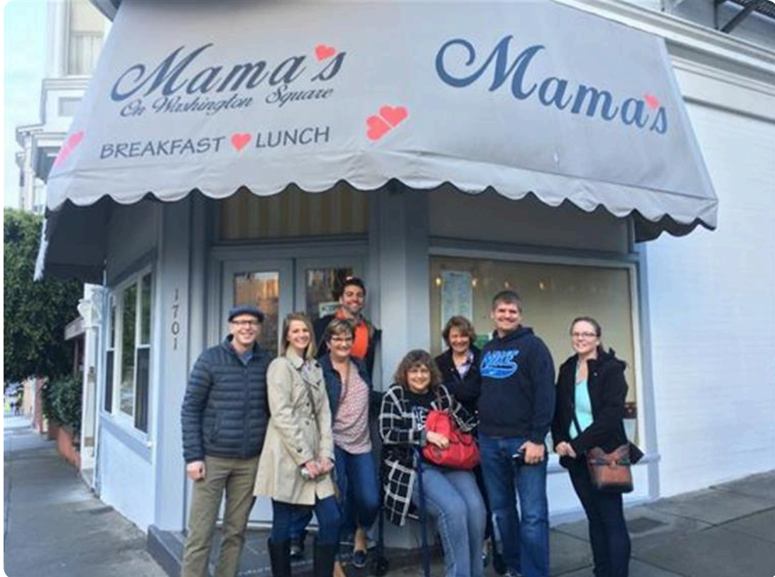
Conference in San Francisco with team from MCC, 2017